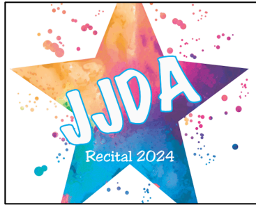
Front of Shirt

Recital T-Shirts will be worn during the finale and commemorative trophy presentation, in which all students participate. All performers' names appear on the back of the shirt. Please place your t-shirt order ($18) through the online system when you purchase your tickets on May 20th.